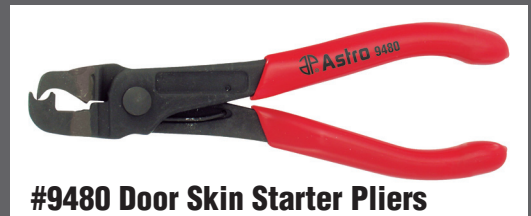
#9480 Door Skin Starter Pliers