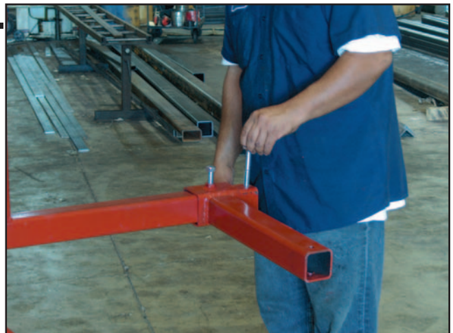
Tighten locking bolt. Safety pin MUST be in place before loading frame